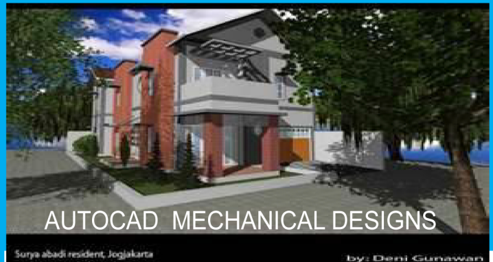
AUTOCAD MECHANICAL DESIGNS