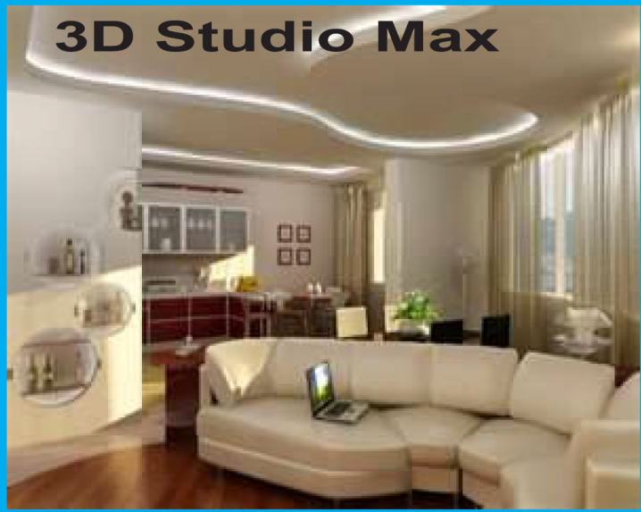
3D Studio Max